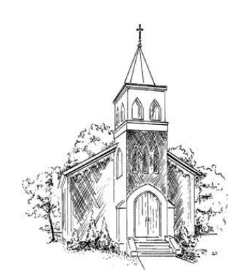
St. Stanislaus, Chatsworth Sunday 9:00 am